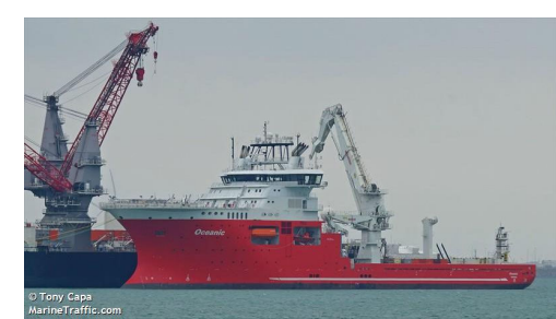
M/V Oceanic Call Sign : 9HA4426