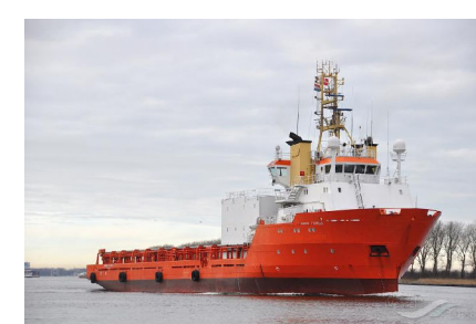
M/V Carrier Express Call Sign : OXVP2 (Bubble Curtain Vessel)