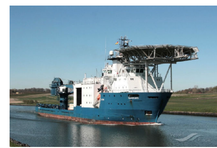
M/V Geosund Call Sign : LAC18 (clearance vessel)